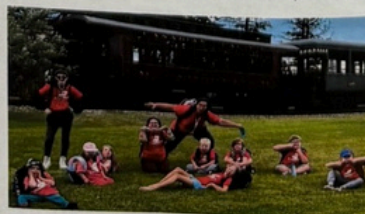
Due to unforeseen circumstances, weekly field trips may be subject to change.

Our Summer Fun kids love Discovery Canyon so much, we have to book it TWICE! Let's soak up the last bit of summer at Discovery Canyon!